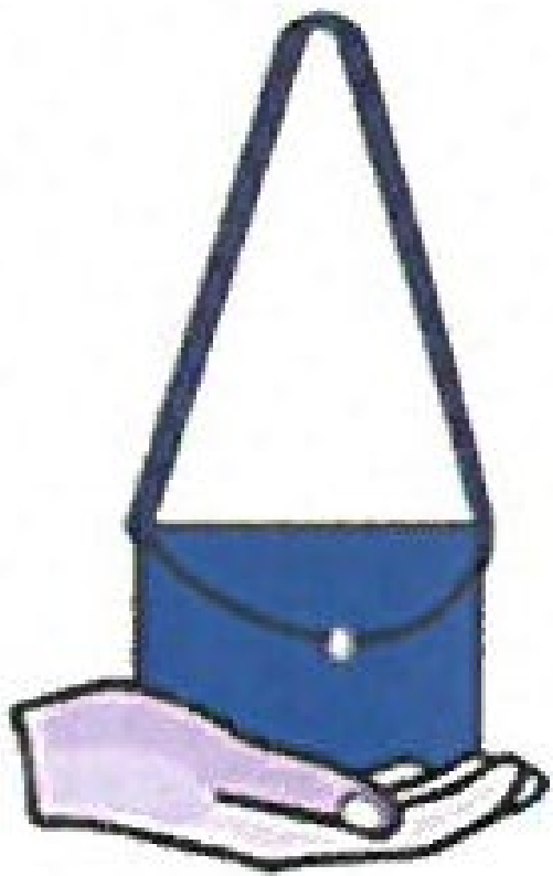
Clutch With Shoulder Strap No Larger than 4.5"x6.5"