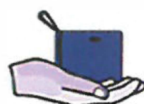
Clutch With Wrist Strap No Larger than 4.5"x6.5"