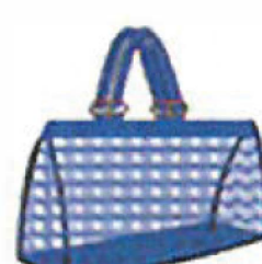
Printed Plastic Bag