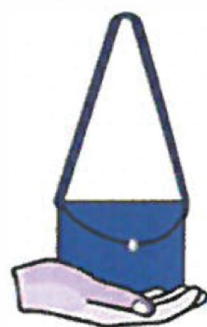
Clutch With Shoulder Strap No Larger than 4.5"x6.5"