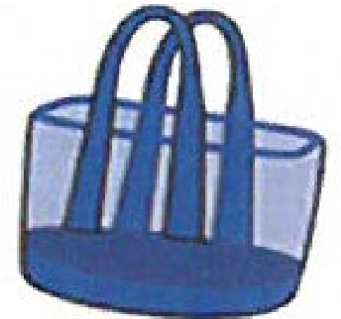
Oversized Tote Bag