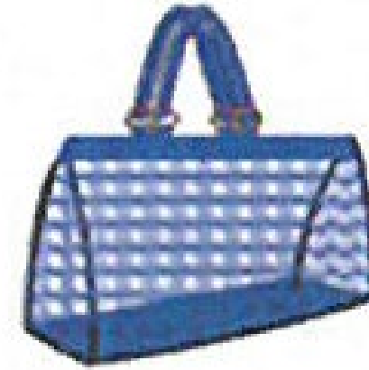
Printed Pattern Plastic Bag