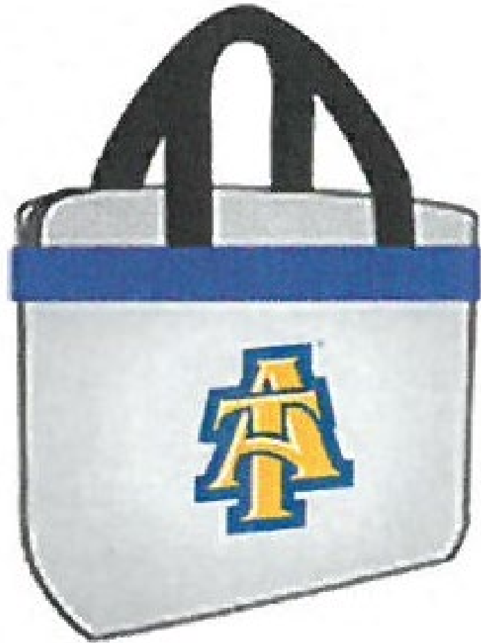
12"x12" Clear Plastic Bag