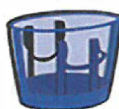
Tinted Plastic Bag