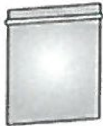
1 Gallon Plastic Freezer Bag