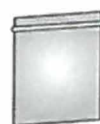
1 Gallon Plastic Freezer Bag