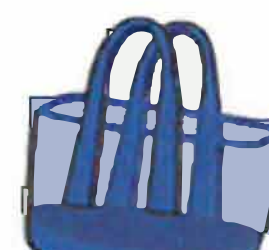
Oversized Tote Bag