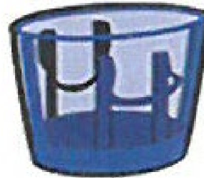
Tinted Plastic Bag