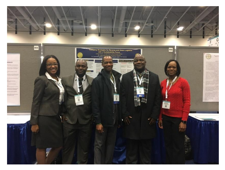
Figure 2: TRB and Eisenhower Fellows posing with CATM director at TRB poster session

CATM's Summer Transportation Research Internship program was developed during this reporting period. The eight-week program is designed to provide NC A&T undergraduate