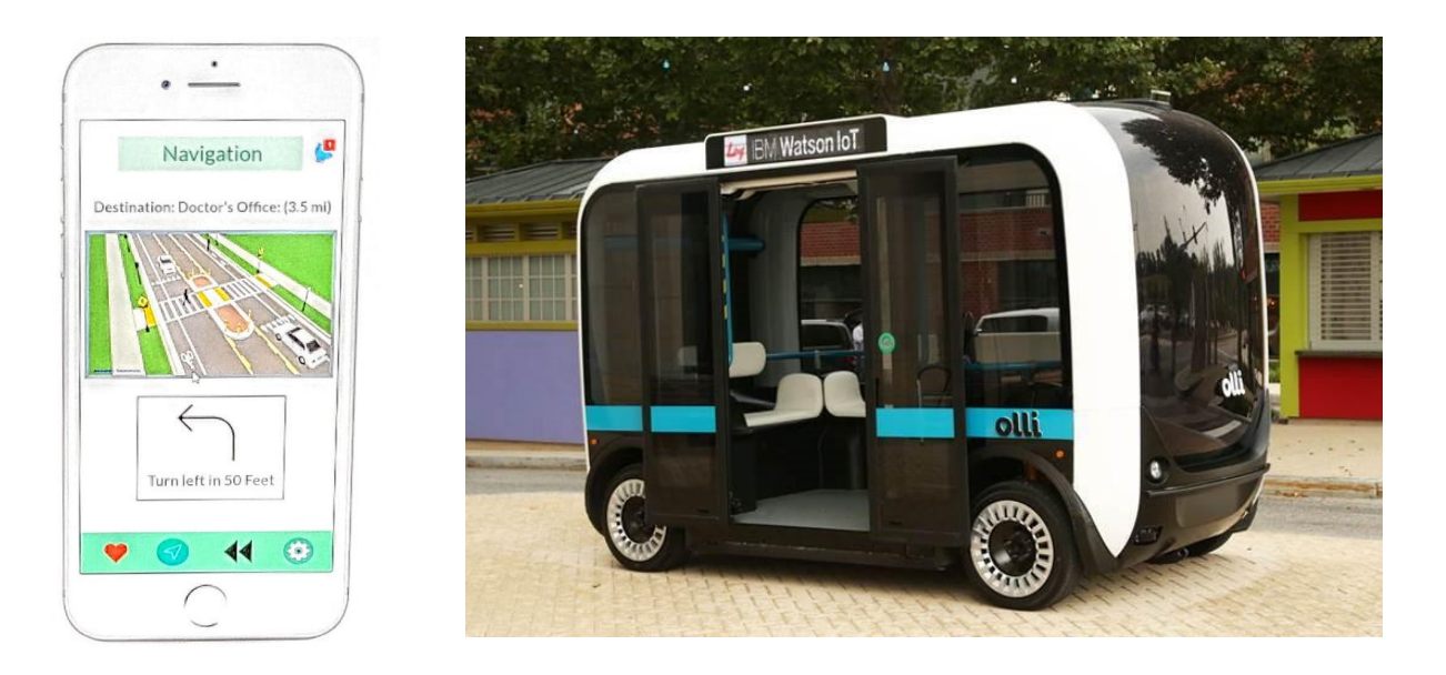
Figure 3: Prototype of the VRU-MAP app (left). Prospective vehicle for Last-Mile project (care of Local Motors)