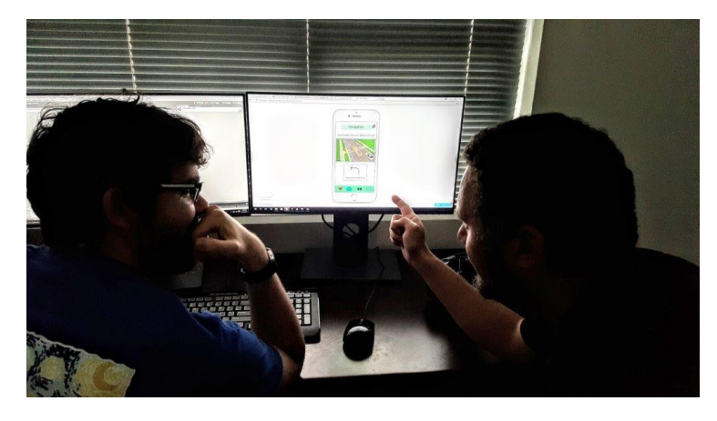
Figure 4: VTTI senior computer science undergraduate student assisting researcher with the coding of the VRU-MAP app prototypes.

The undergraduate and graduate students assisting with the new research projects are being introduced to various facets of transportation. For example, students working on the Emergency project learned about the highway transportation system and North Carolina's emergency management strategy. One of them has even chosen emergency transportation management as his dissertation topic. Several other students, such as the one shown in Figure 4, are learning how to apply their discipline-specific knowledge in the transportation domain.