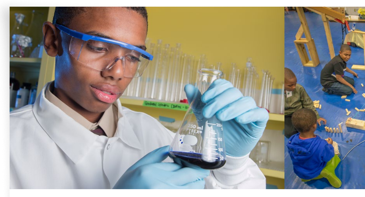
Funded by a $1.6 million grant from the U.S. Department of Agriculture's National Institute of Food and Agriculture, the center seeks to expand students' ideas of viable careers.

"Our nation is No. 1 in agriculture innovation in the world. But this innovation won't continue if we don't invest in the next generation and our future. It is important that we understand that and have mechanisms such as the MEA Center to ensure that."