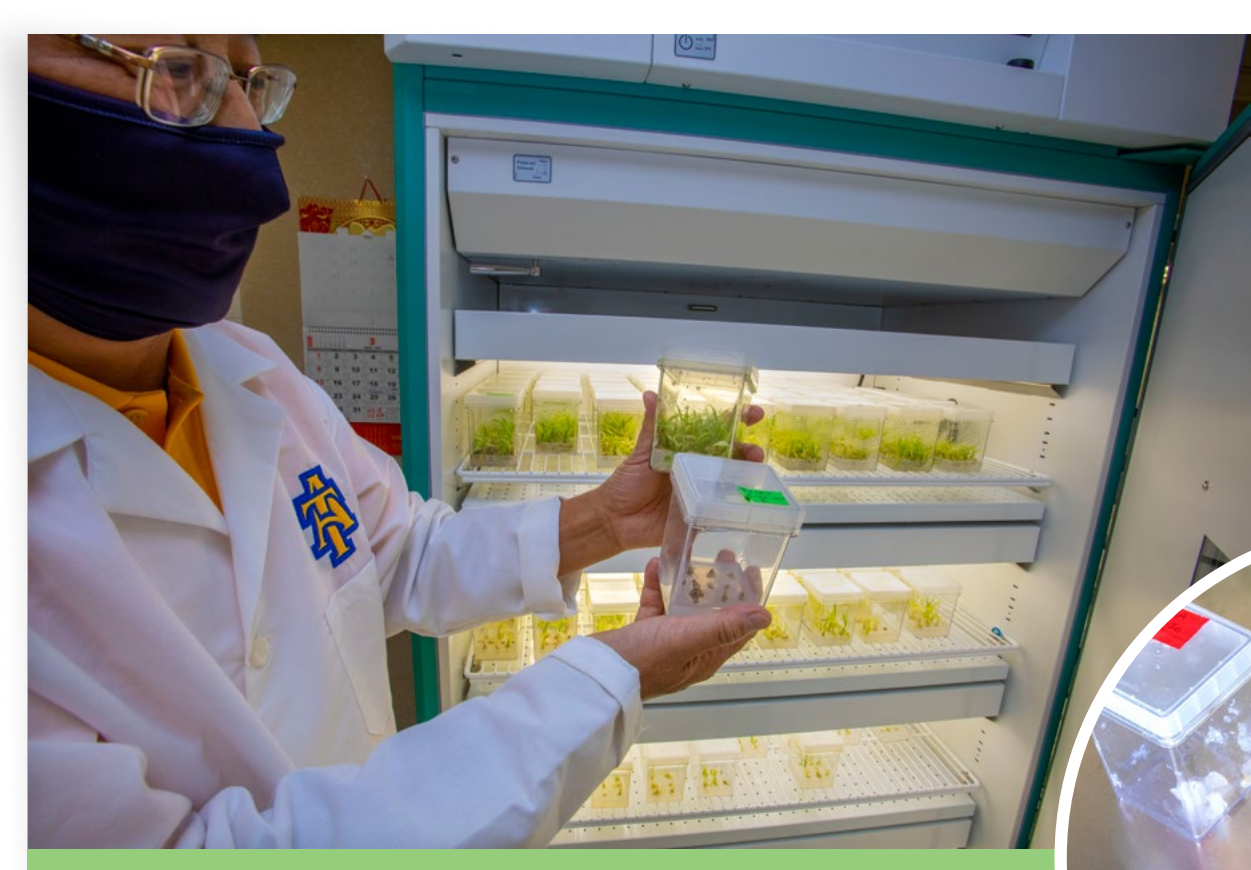
Ginger plants grown from tissue cultures, such as the varieties in containers in his lab, have higher levels of the compounds that enhance ginger's natural health benefits, Yang said.

factored out expenses, farmers can make a lot of money."